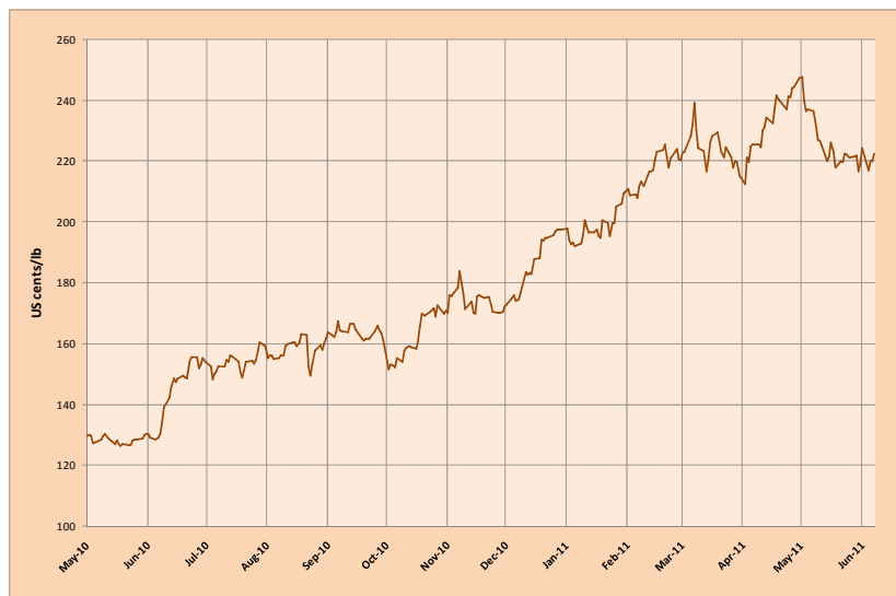
Graph 1: ICO composite indicator prices Daily: 3 May 2010 to 10 June 2011