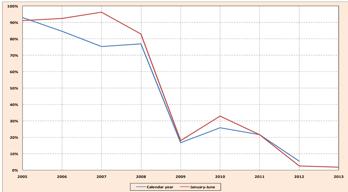
Graph 3: NYSE Liffe gradings Percentage graded deemed to be below the CQP

9. The Organization will continue to monitor the gradings results for Arabica and Robusta coffee as posted on the ICE and NYSE Liffe websites.