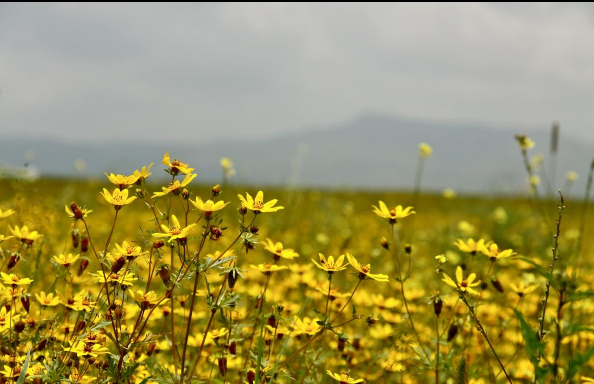
Photo: Meskel Flowers, endemic to Ethiopia, blossom during the Ethiopian New Year, which is marked in September.