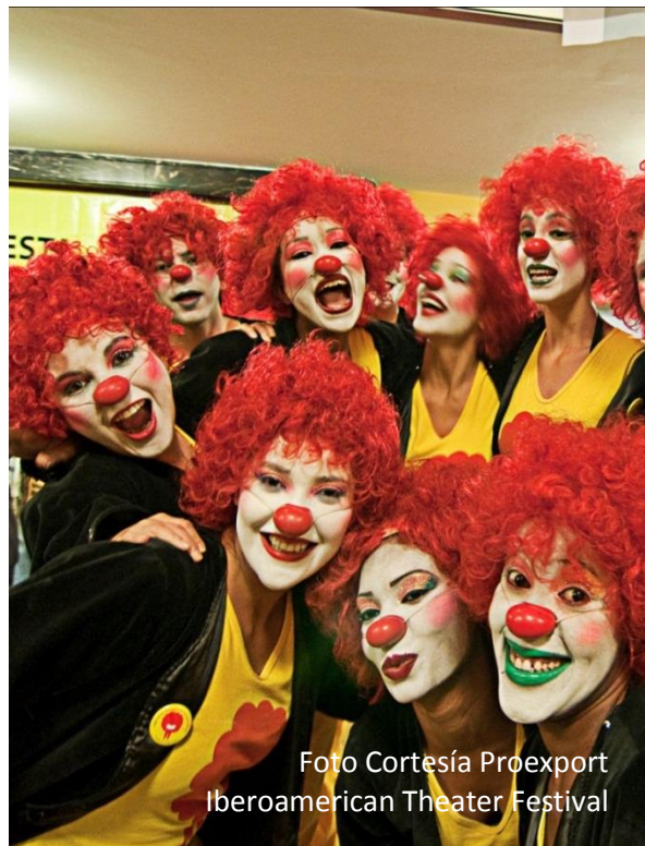
Iberoamerican Theater Festival

Welcome to the city that is 2,600 meters closer to the stars.