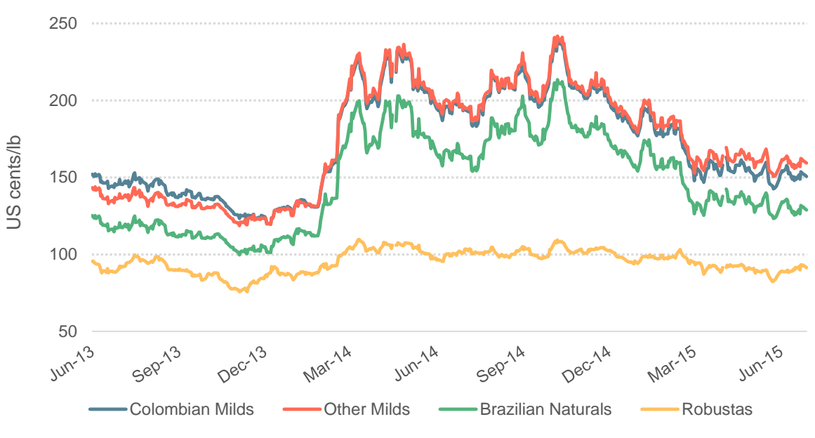
Graph 2: ICO group indicator daily prices

© 2015 International Coffee Organization (www.ico.org)