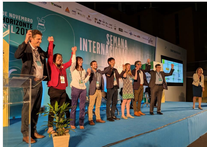
MI launching - Global Coffee Sustainability Conference Expominas, Belo Horizonte, MG, November 2018