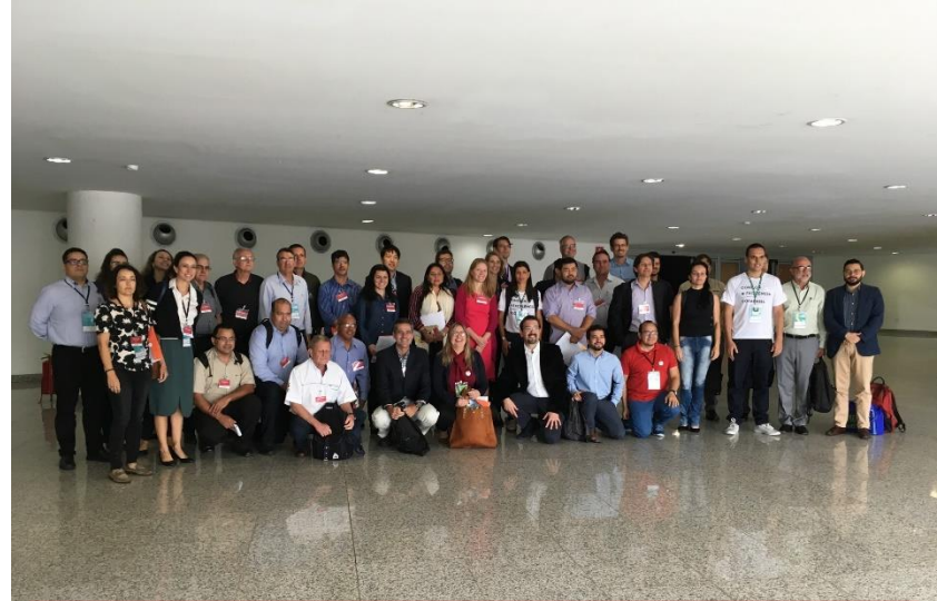
MI Partners - International Coffee Week Expominas, Belo Horizonte, MG, November 2018