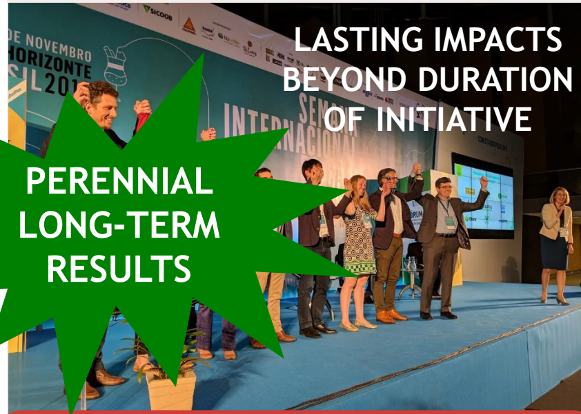
MI launching - Global Coffee Sustainability Conference Expominas, Belo Horizonte, MG, November 2018

LASTING IMPACTS BEYOND DURATION OF INITIATIVE