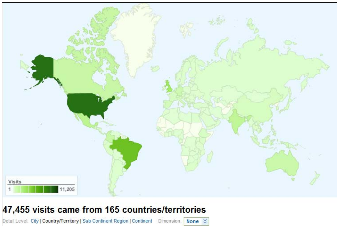
FIGURE 7 – Source of visitors in May 2010