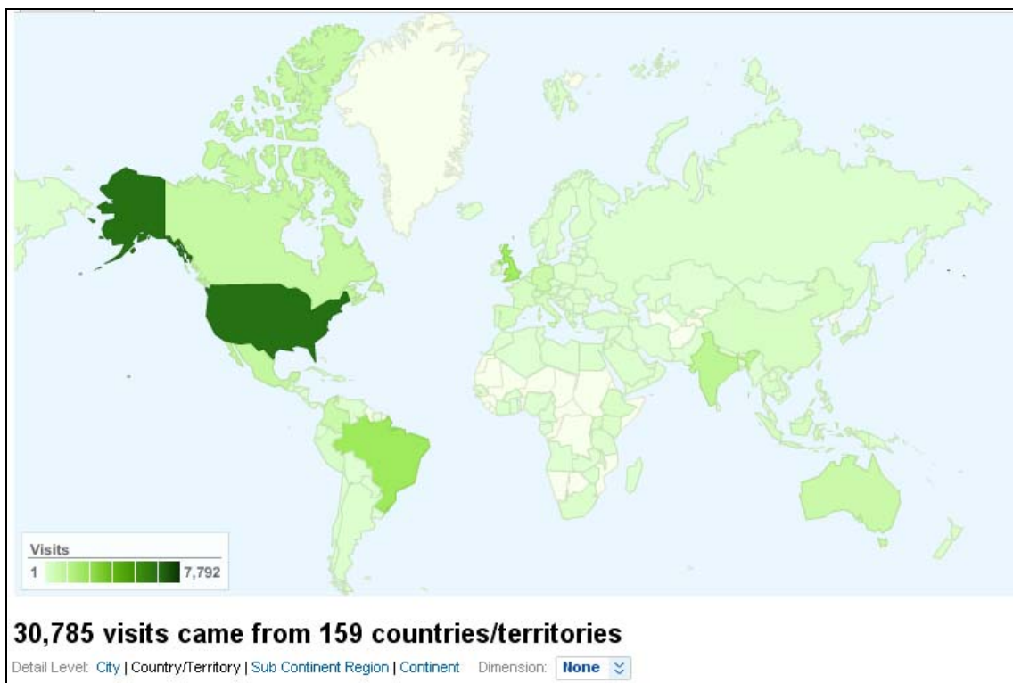
FIGURE 3 – Source of visitors in March 2010

Regarding the origin of traffic, 52% of visitors came from search engines (Google, Yahoo, Bing, etc.), 26% from reference sites (e.g.: ICO website) and 22% from direct traffic. The average time spent on the CCN was around 3 to 4 minutes. Users' needs included coffee business opportunities, specific coffee connections and community customization.