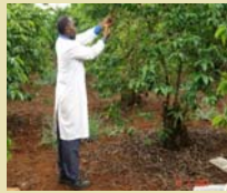
(a) Cultural- (stripping)