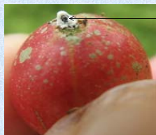
Cbb infected by B. bassiana