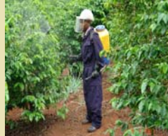
(b) Chemical- (spraying)