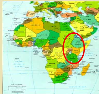
Eastern Africa Region (Kenya, Uganda, Tanzania, Ethiopia, Rwanda & Burundi)