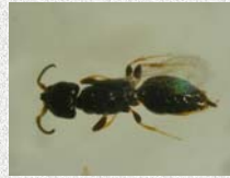
Prorops nasuta .